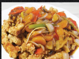
Sweet and Sour Pork