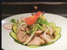
Chilled Meat Salad